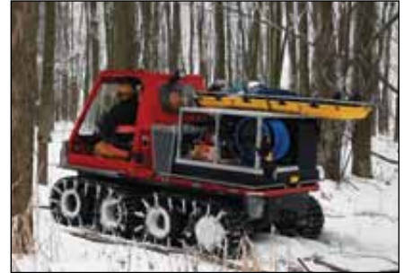
Fire & Rescue