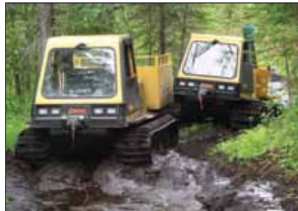
Deep Mud Performance