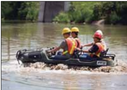
Amphibious Personnel Carrier