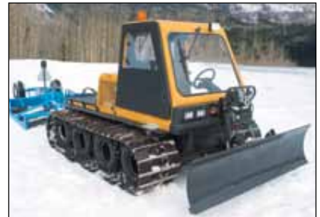
Operation in -40°C (-40°F)