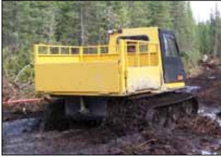
Easy to Install Cargo Box