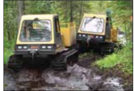
Deep Mud Performance