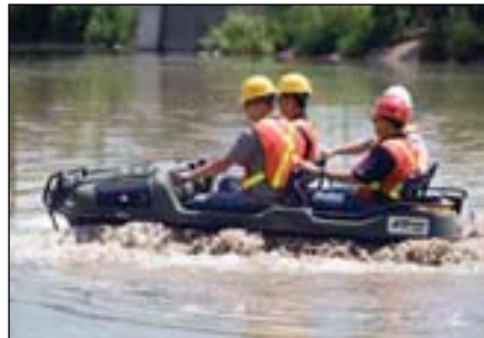
Amphibious Personnel Carrier