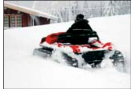
Deep Snow: Operation in -40°C (-40°F)