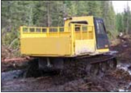
Easy to Install Cargo Box