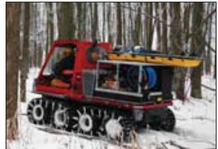
Search & Rescue