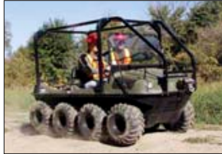
Optional Roll Over Protection Structure