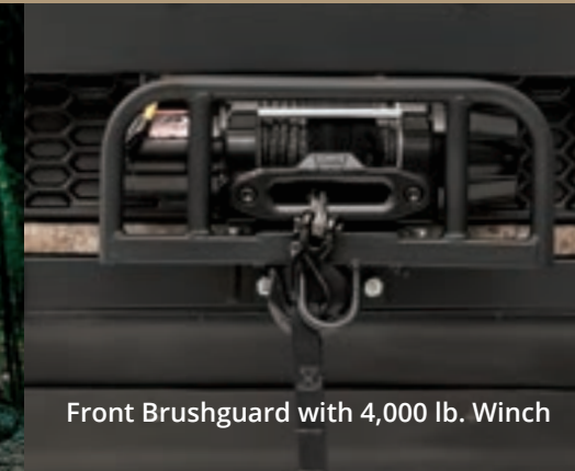
Front Brushguard with 4,000 lb. Winch