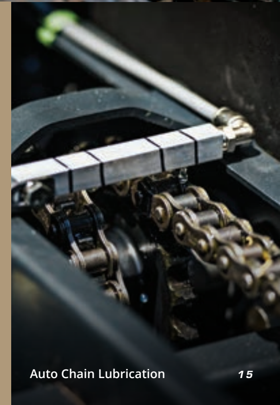
Auto Chain Lubrication